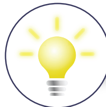
QuiltMaster TM LED lighting: throat, needle, and bobbin