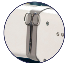
Magnetic tool minder collar