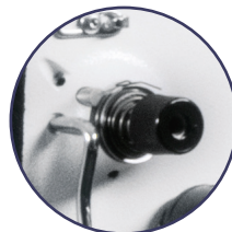
Easy-Set Tension TM