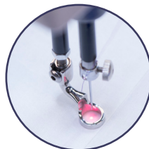
Pinpoint needle laser